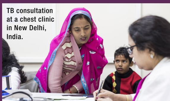
TB consultation at a chest clinic in New Delhi, India.